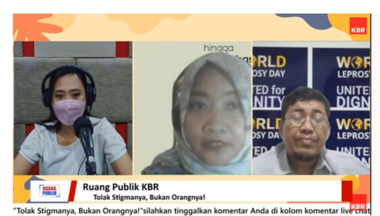
Talkshow Ruang Publik KBR : Tolak Stigmanya, Bukan Orangnya!